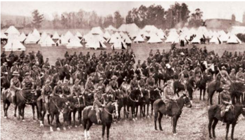
Waikato pre-war training at Bardowie camp, Hautapu, Cambridge, circa 1914.